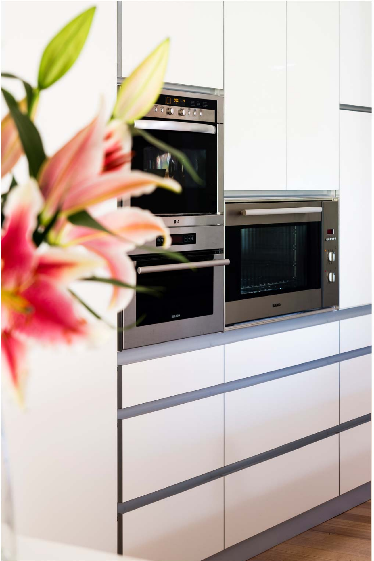
product range: finger pull rails