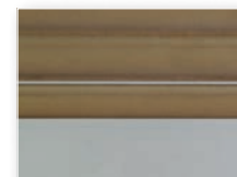
matching decorative kicker for abby and rose door