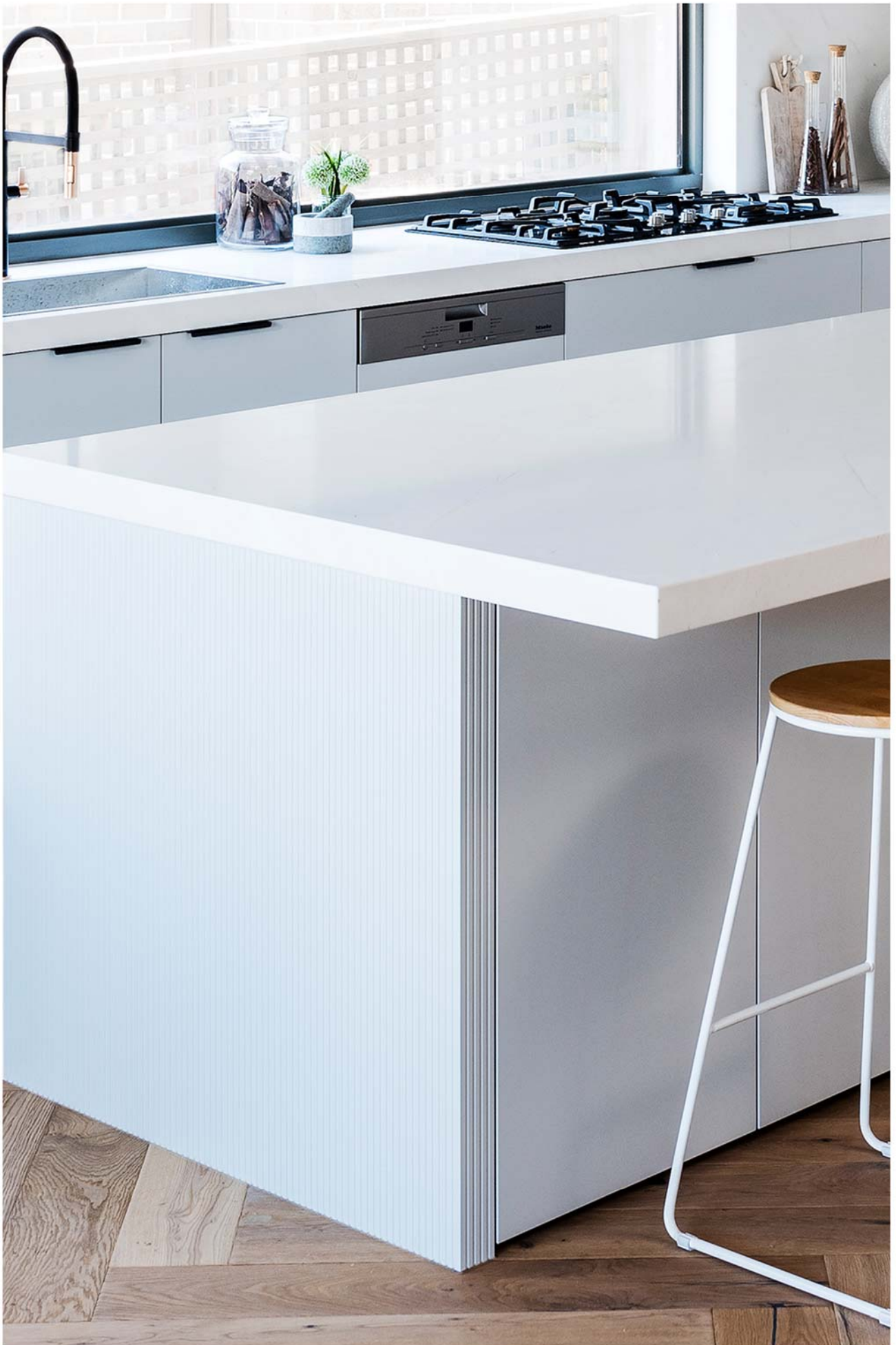
product range: wrap around panels